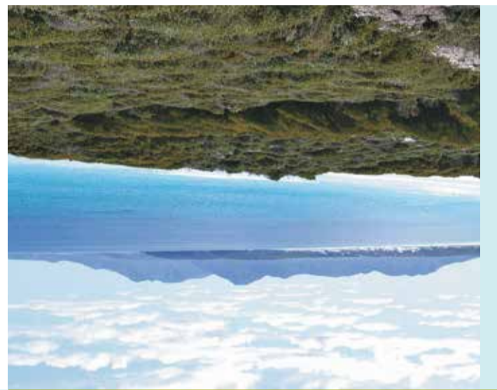
Above Point Charles Bay.

The park is one of the largest and most botanically significant national parks in Australia, with approximately 15 per cent of the State's described plant species growing amid the magnificent landscapes. So far, 1883 plant species have been identified, 75 of which are found nowhere else. activities, in highly scenic and diverse coastal and inland wide range of opportunities for world class nature-based facilities, including two new long walktrails, provide a Perth. Recently improved sealed road access and recreational towns of Bremer Bay and Hopetoun, 420km south-east of on the central south coast of Western Australia, between the Fitzgerald River National Park covers an area of 297,244ha