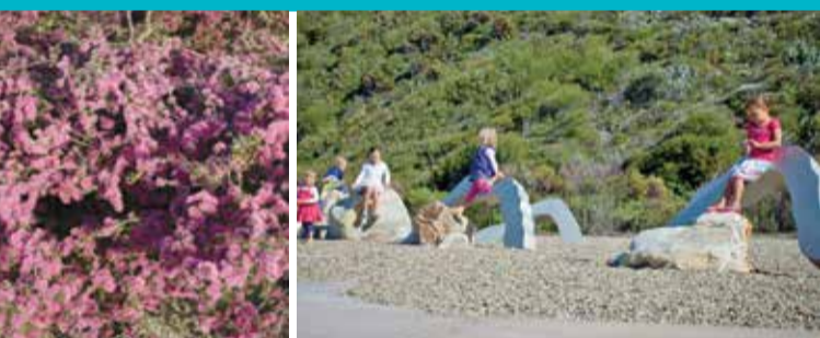
Above Melaleuca papillosa . Above right Barrens Beach.