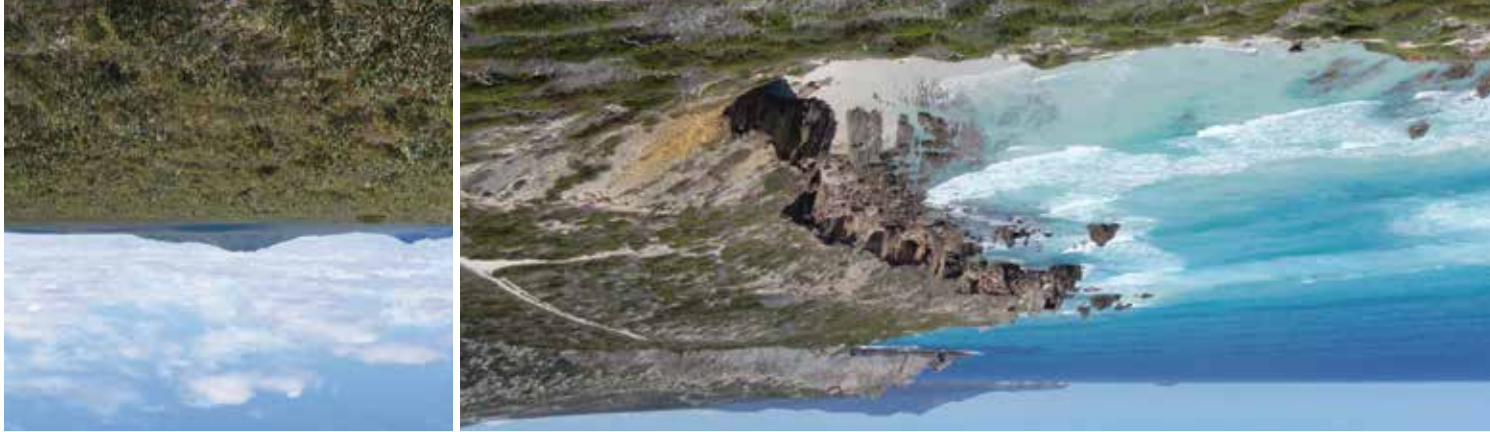
Below Whalbone Cove. Below right Fitzgerald River National Park.

Front cover: Fitzgerald River National Park.