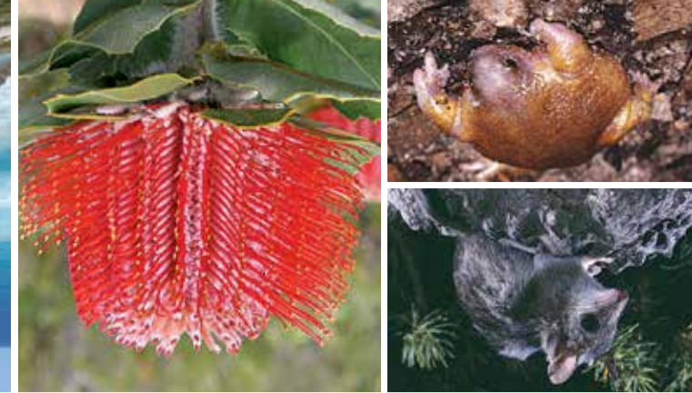
Below Dunnart. Bottom Turtle frog. Below right Banksia cocinea.

The park is one of the largest and most botanically significant national parks in Australia, with approximately 15 per cent of the State's described plant species growing amid the magnificent landscapes. So far, 1883 plant species have been identified, 75 of which are found nowhere else. activities, in highly scenic and diverse coastal and inland wide range of opportunities for world class nature-based facilities, including two new long walktrails, provide a Perth. Recently improved sealed road access and recreational towns of Bremer Bay and Hopetoun, 420km south-east of on the central south coast of Western Australia, between the Fitzgerald River National Park covers an area of 297,244ha